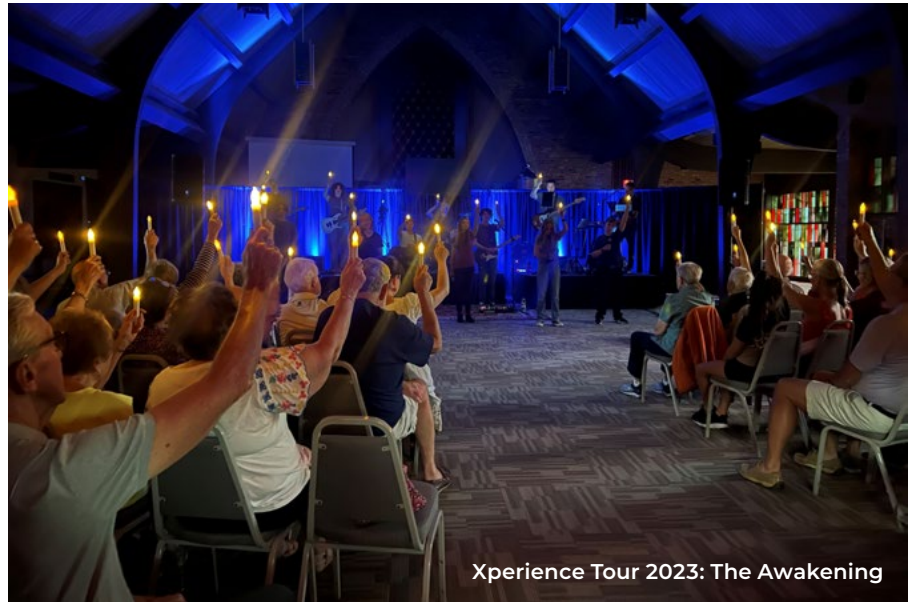
Xperience Tour 2023: The Awakening