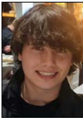
Wilson Secor Myers Park