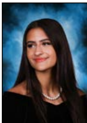
Brooklyn Lamb Indian Land